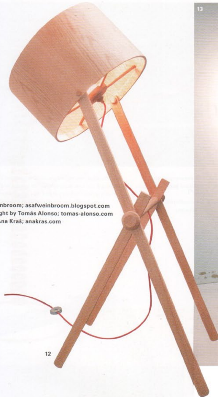
12 Asaf Weinbroom; asafweinbroom.blogspot.com 13 Bottle Light by Tomás Alonso; tomas-alonso.com 14 Hive by Ana Kraš; anakras.com